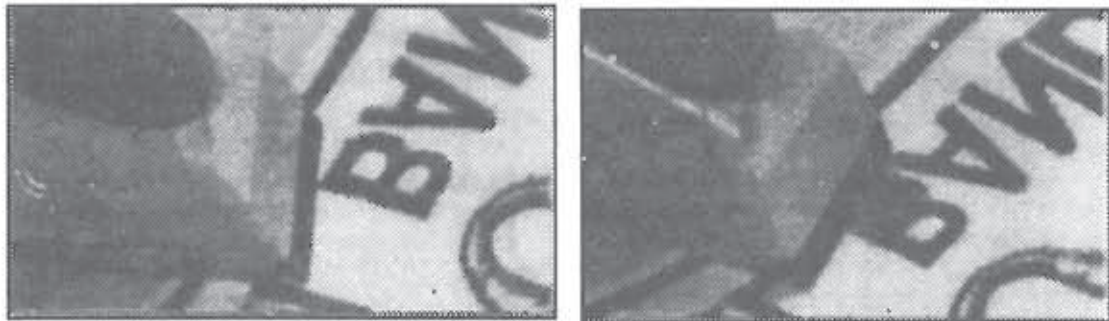
FIG. 1 & 2

There are two kinds of stitching in this category: satin stitch and fill stitch. Procedures to remove these stitches are listed in 1 and 2: